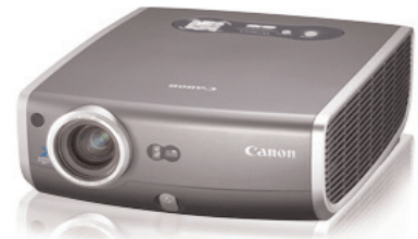
Realis SX-7 Mark II